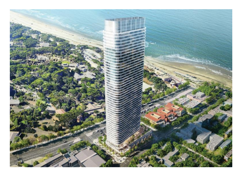
This is the kind of massive and unwise growth the Sacramento politicians are allowing. Our measure will allow communities to shape growth so they can build enough affordable housing without destroying the character of neighborhoods, creating traffic gridlock and leaving taxpayers with higher bills.

According to our petition management vendor (which has gathered more than 44 million signatures and qualified hundreds of state and local initiatives),